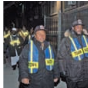
Town Watch volunteers are on the rise across the city.

BRIAN X. MCCRONE bmccrone@metro-philly.com